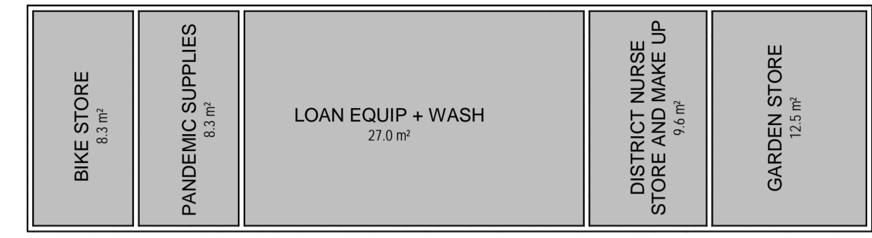
2 UTILITY BUILDING - PLAN A02.001 1 : 100